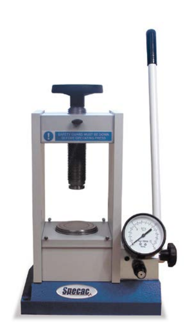
Specac's Hydraulic Press

Gravure printing has gained widespread use because of high quality prints obtainable. It is however more expensive to change print design than with flexographic printing and therefore more cost effective for high quality volume or repetitive applications.