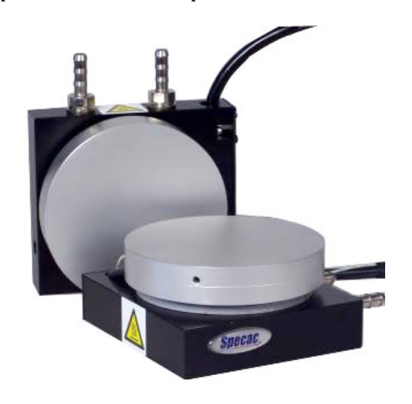
Specac's Heated Platens

Coldseal adhesion applied to the uncoated side (intended to seal the product after packaging), could be affected by the ink, or could cause film adhesion during storage if formulated incorrectly or not optimized. The films tested after 16 hours and 4 months showed no sealing failure. Generally, the maximum permissible ink block adhesion measure read on a tensiometer is for a 50gm weight applied across a 2 inch length to separate 1 inch wide of printed film.